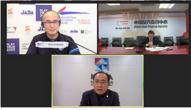
CHINADA-JADA-KADA singed MOU right after Paralympics in September 2021