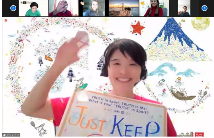
21 January 2022