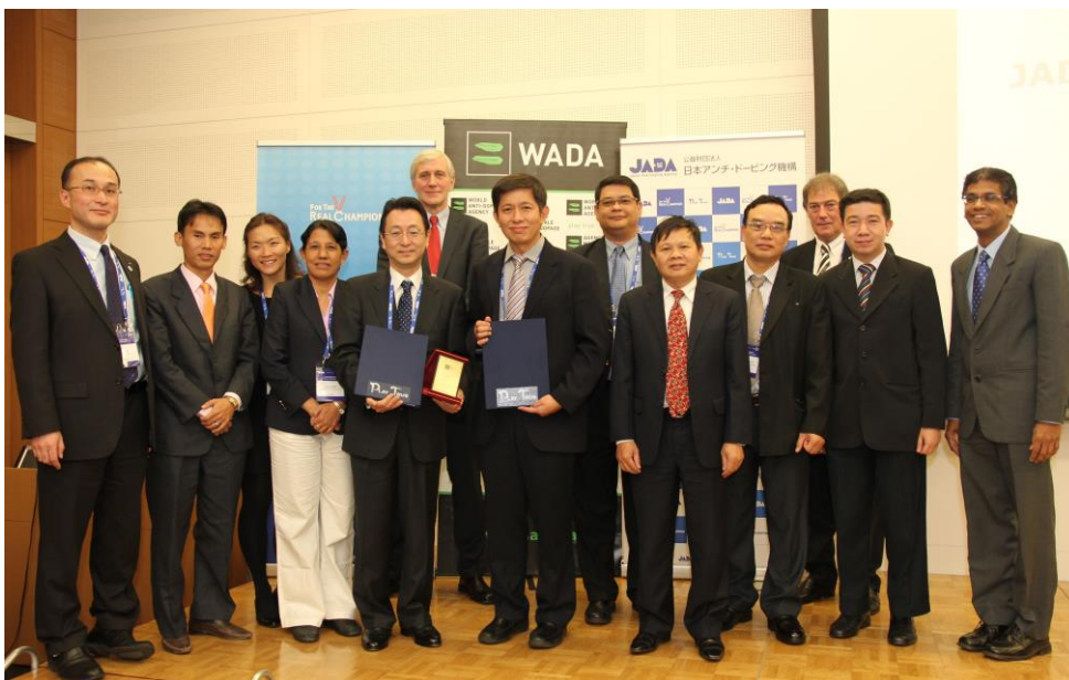
SEA RADO Team in Tokyo

JADA is currently working closely with the newly created Vietnam Anti-Doping Agency (VADA) for their preparations of the 2019 Asian Games hosted in Hanoi, Vietnam. With the Tokyo 2020 Olympic and Paralympic Games in Japan, it is expected that there will be a plenty of opportunities to work closely with SEA RADO countries.